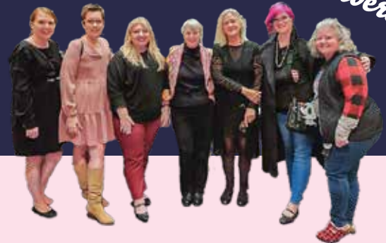
Some Support Group Members

Support Group is hosted biweekly at BCFO's Springfield office by licensed counselor Jacey Collins, with a remote option available on Zoom. Support Group is for breast cancer survivors of all stages. Call us for more info!