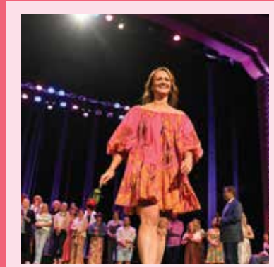
A Time to Share