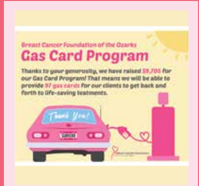
Gas Card Campaign