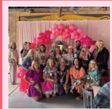
A Time to Share on the Square