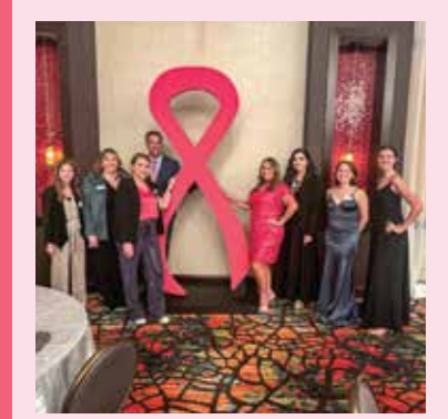
Pink Ribbon Gala