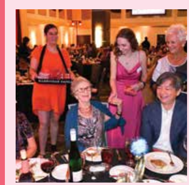
Hooked on Dance